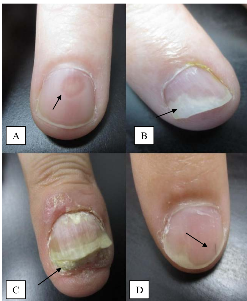
Fig. 2. Nail bed disease: (A) oil spot changes, (B) onycholysis, (C) subungual hyperkeratosis, and (D) splinter hemorrhage.

in the nail plate from inflammation in the middle portion of the nail matrix [29]. With a high degree of inflammation in the nail matrix, nail plate disfiguration or crumbling occurs [28]. Nail ridging (onychorrhexis) can correspond with linear inflammation within the nail matrix [26,29]. Red spots on the lunula are thought to be a consequence of increase blood flow to the nail matrix [30]. Oil spot changes are simply from an increased concentration of dead or damaged cells, as well as proteinaceous fluid [26,28,31]. Inflammation occurring at the tip of the nail causes a detachment of the nail plate and the corresponding lifted appearance of the nail [29]. Subungual hyperkeratosis is caused by increased keratinization on the nail bed, producing a thickening of the nail bed itself [26,29]. As the nail grows out, fragile blood vessels of the nail bed can be irritated, causing blood to extravasate, resulting in red or purple linear discolorations or splinter hemorrhages [28,29].