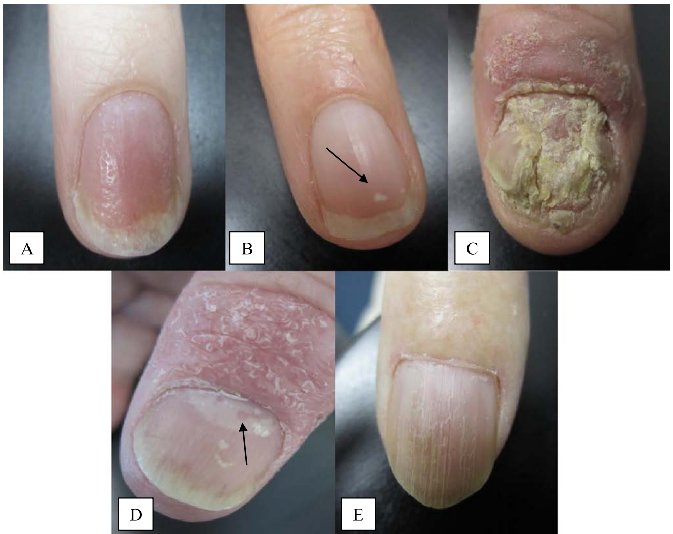
Fig. 1. Nail matrix disease: (A) pitting, (B) leukonychia, (C) crumbling, (D) red spots on the lunula, and (E) onychorrhexis. (For interpretation of the references to color in this figure legend, the reader is referred to the web version of this article.)

Each of the different nail changes arise from unique processes within the nail complex. The loss of abnormal keratinocytes situated on the nail plate as it grows past the cuticle leaves divots or pits in its place [26,28,29]. Leukonychia are white discolorations