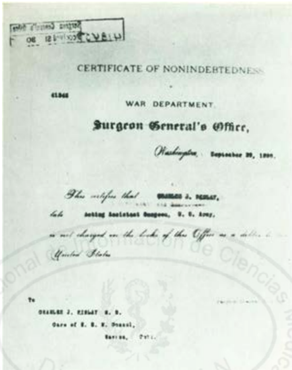
Facsímil de otro documento que consta en el expediente del Dr. Finlay para su ingreso en el Ejército Americano, de que no tiene deudas contraídas.