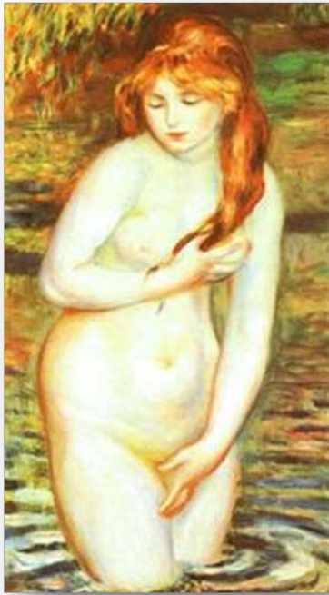
The Bather, 1888.