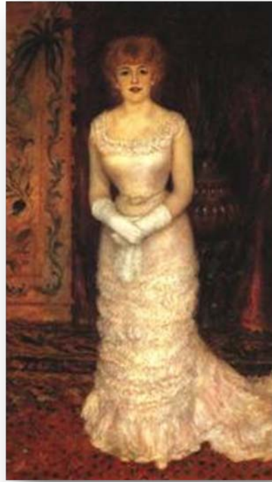
Portrait of Jeanne Samary, 1878