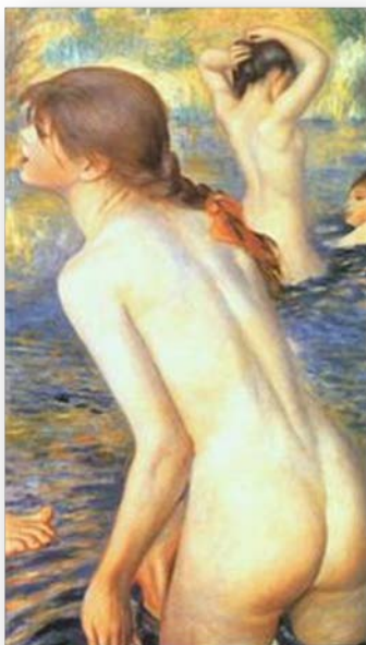
The Bathers, detail, 1887