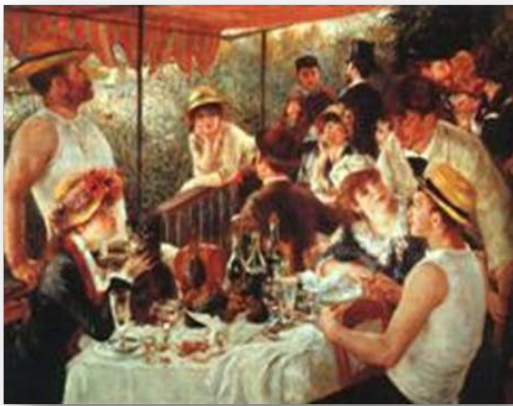
The Boating Party Lunch, 1881