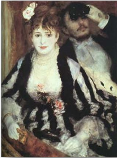
La Loge, 1874