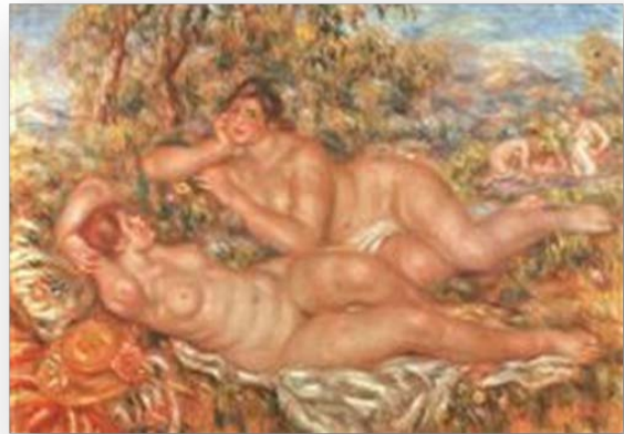
The Great Bathers (The Nymphs), 1918