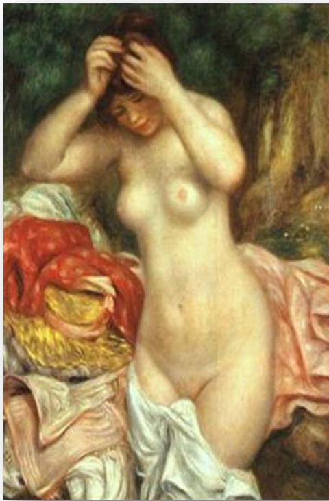
Bather Arranging her Hair, 1893