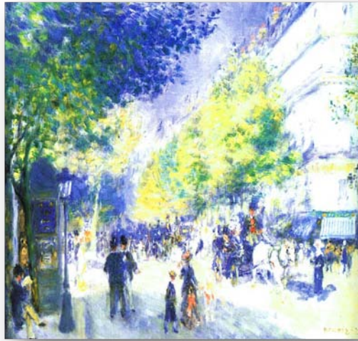
Les Grands Boulevards, 1875