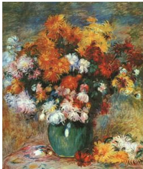
Vase of Chrysanthemums, 1895